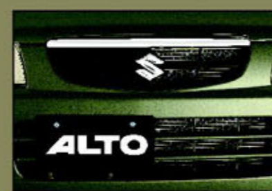
Stylish New Front Grille & Bumpers