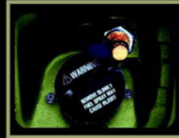
Side-by-side CNG / Petrol filling