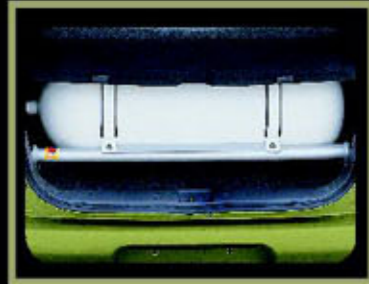
Optimized Capacity Cylinder