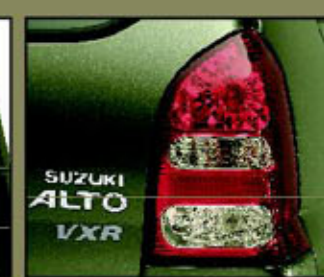
Brilliant New Rear Combination Lamps

Easy parking with a small 4.2-meter minimum turning radius