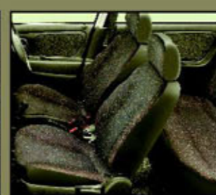
Trendy New Upholstery