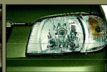
Sparkling New Head Lights