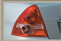
● Sparkling Rear Combination Lamp