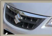
● Stylish Chrome Grille