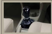
● Manual Transmission