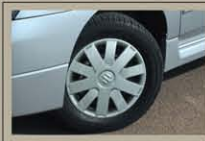
● Full Wheel Caps