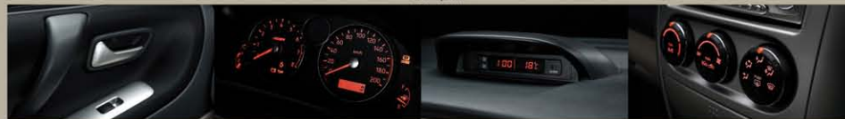
Silver painted inside door handles